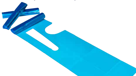
Disposable aprons on roll

} Apron Line – disposable aprons on roll }