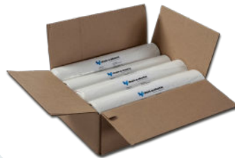
Bags in a box