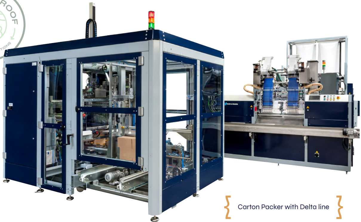
} Carton Packer with Delta line }