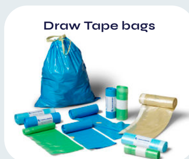
Draw Tape bags