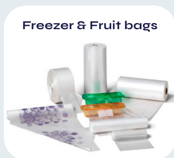
Freezer & Fruit bags