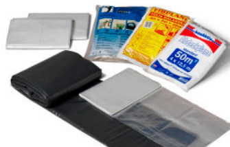
Table covers and drop cloths in flat packs